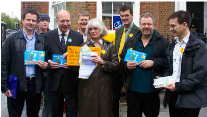
Lib Dems in St Albans turning on the Green Tax Switch