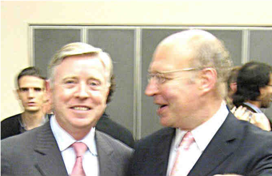
Irish Liberal Pat Cox was President of the European Parliament 2002-04

Pat Cox, President of the International European Movement, speaks to the 27 th Congress of the European Liberal Democrats (ELDR) in Bucharest, 12 October 2006